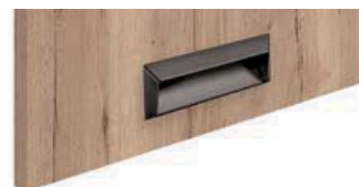
Maniglia incassata 581 finitura bronzo titanio anta L 15 → passo 64 mm anta da L 30 a L 120 → passo 128 mm

Built-in handle 581 titanium bronze finish door W 15 → centre-to-centre distance 64 mm door from W 30 to W 120 → centre-to-centre distance 128 mm